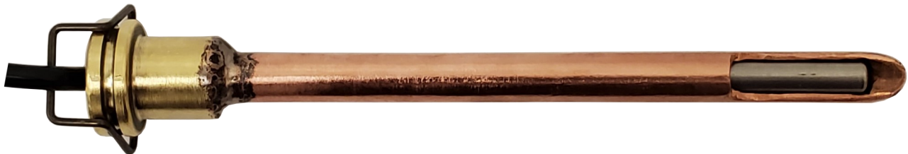
*SunEarth's Thermowell (SWT connection) with temperature sensor inserted.

Due to SunEarth's policy of continuous product improvement, specifications are subject to change without notice.