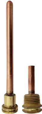
Thermowell(s) with NPT and SWT Connections